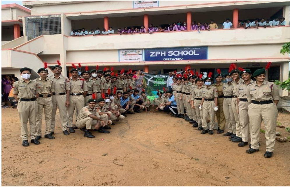
Group photo with NCC Volunteers at ZPH School at Pedapalem on 01/09/21