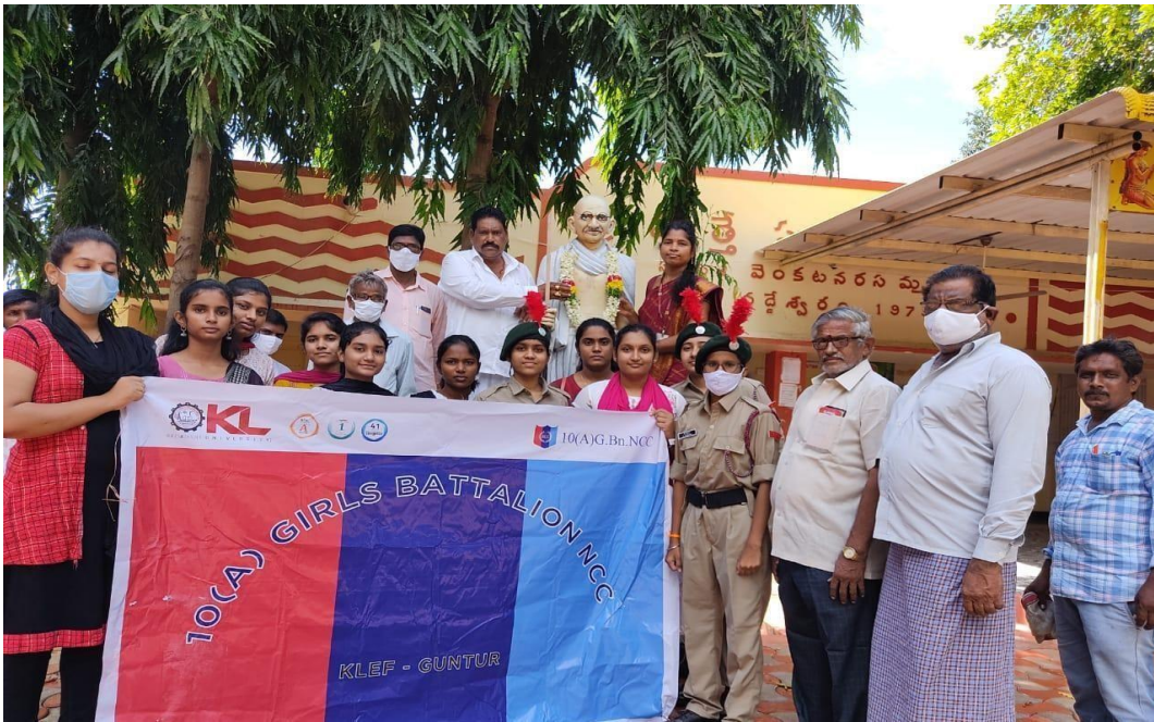
The statue of Mahatma Gandhi Painted in vaddeswaram village on 30/08/21