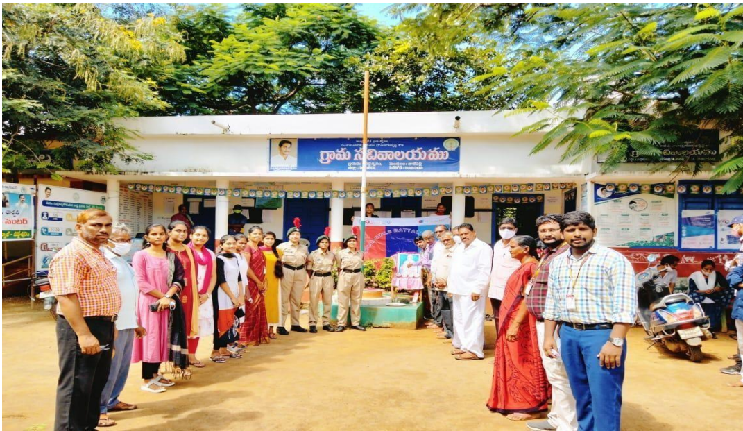
“Swachhta Hi Seva” a campaign under the Swachh Bharat Mission that aims to increase participation towards Swachhta on 30/08/21