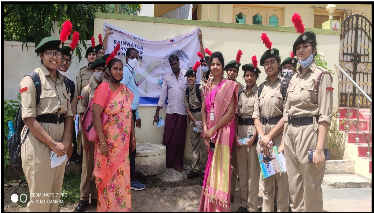
Cadets, NCC officers, volunteer and a villager at a soaking pit on 03-08-2021