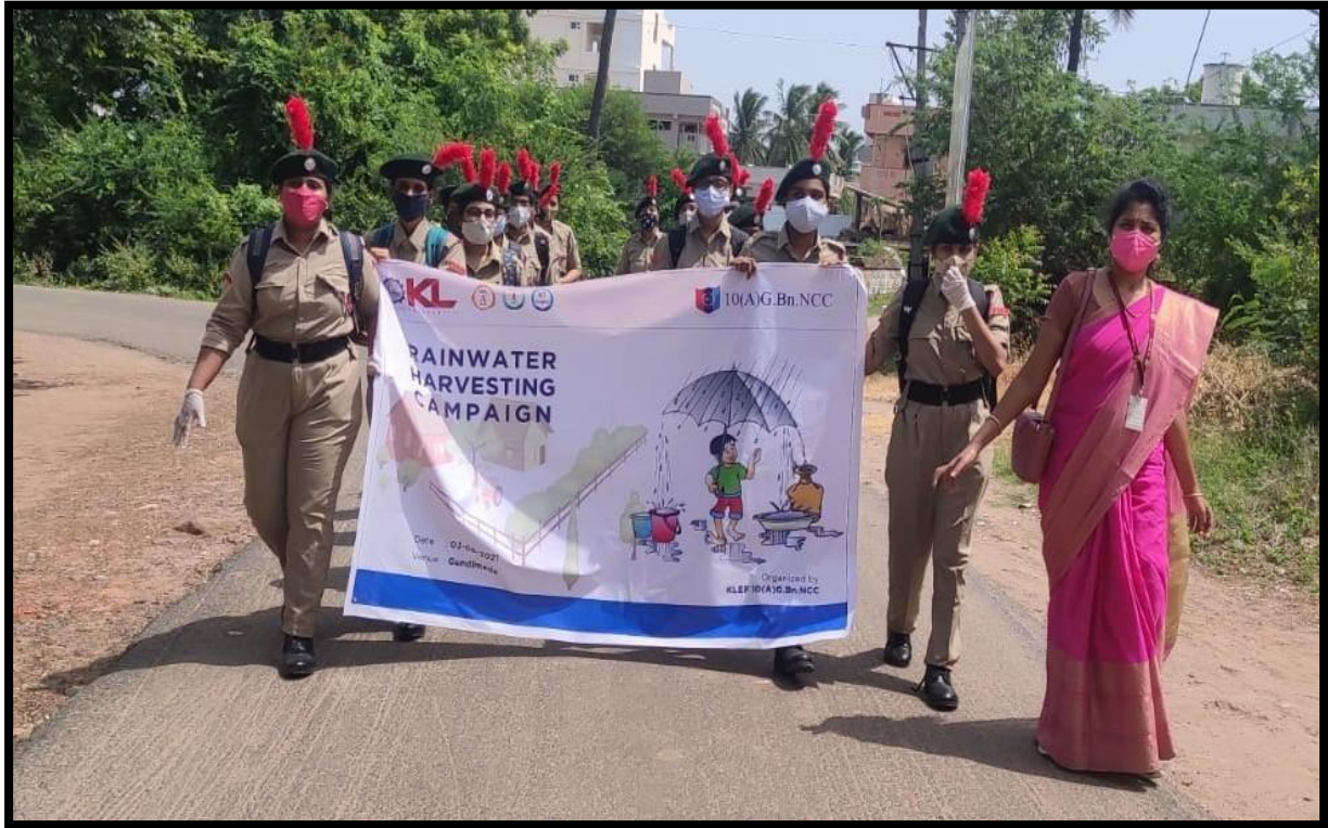
Cadets marching in the village along with NCC officer on 03-08-2021