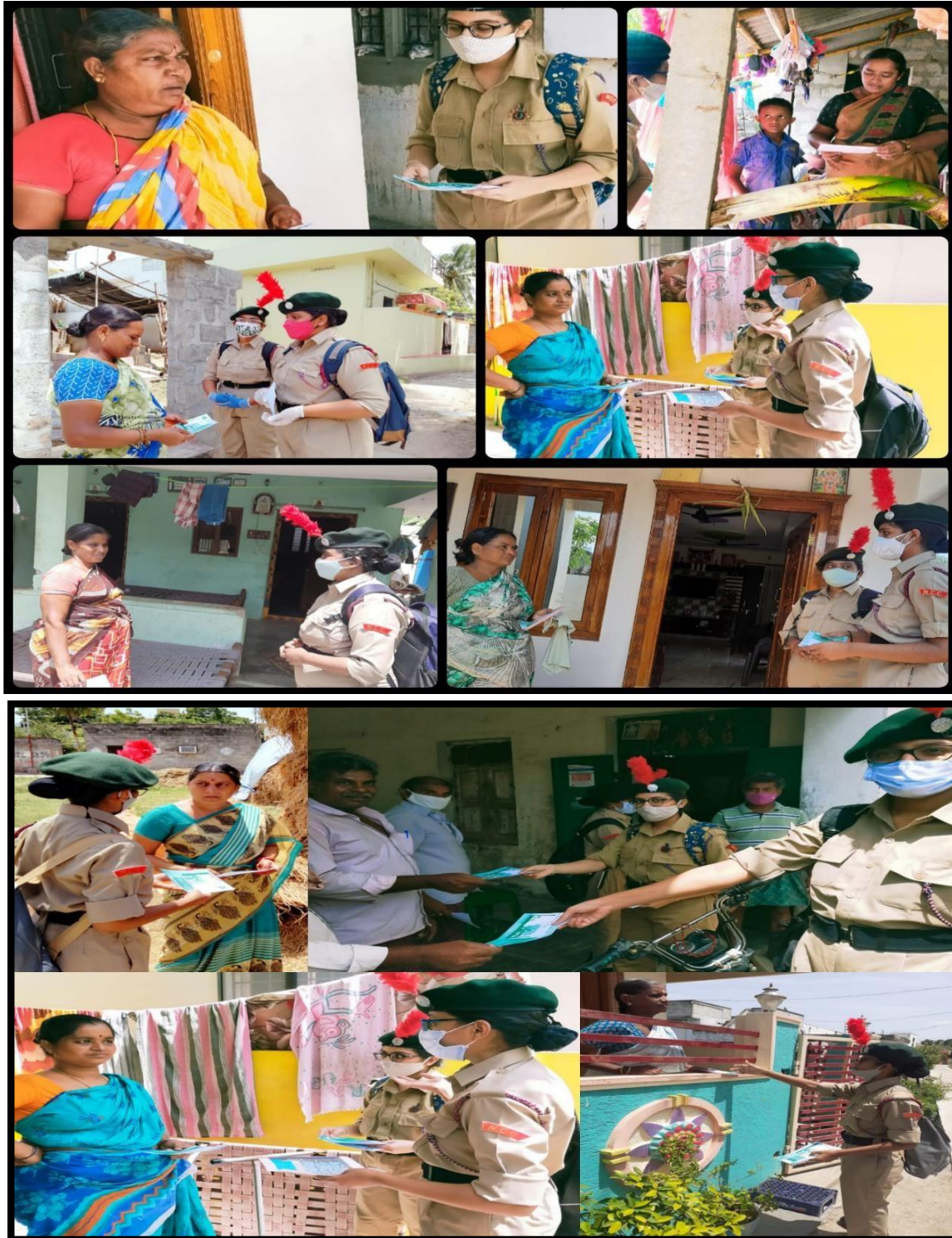
Cadets raising awareness and distributing pamphlets among people on 03-02-2021