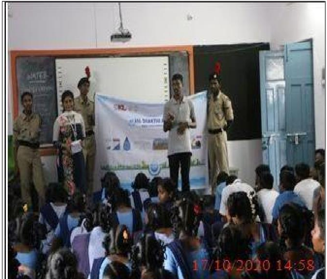
NCC cadets depicting the water importance and Jala Shakthi Abhiyan importance to the school students of Nuthakki and the volunteers of health well ness center of nuthakki on 17-09-2019