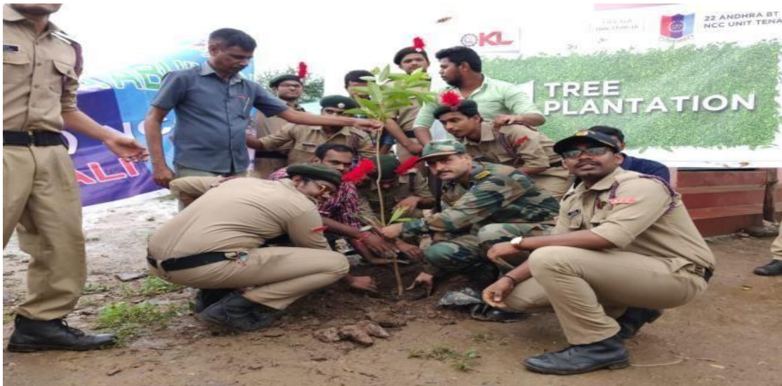
Tree plantation conducted at Govt school Gundimeda Village by 22(A) Battalion PI staff and cadets on 13-08-2018