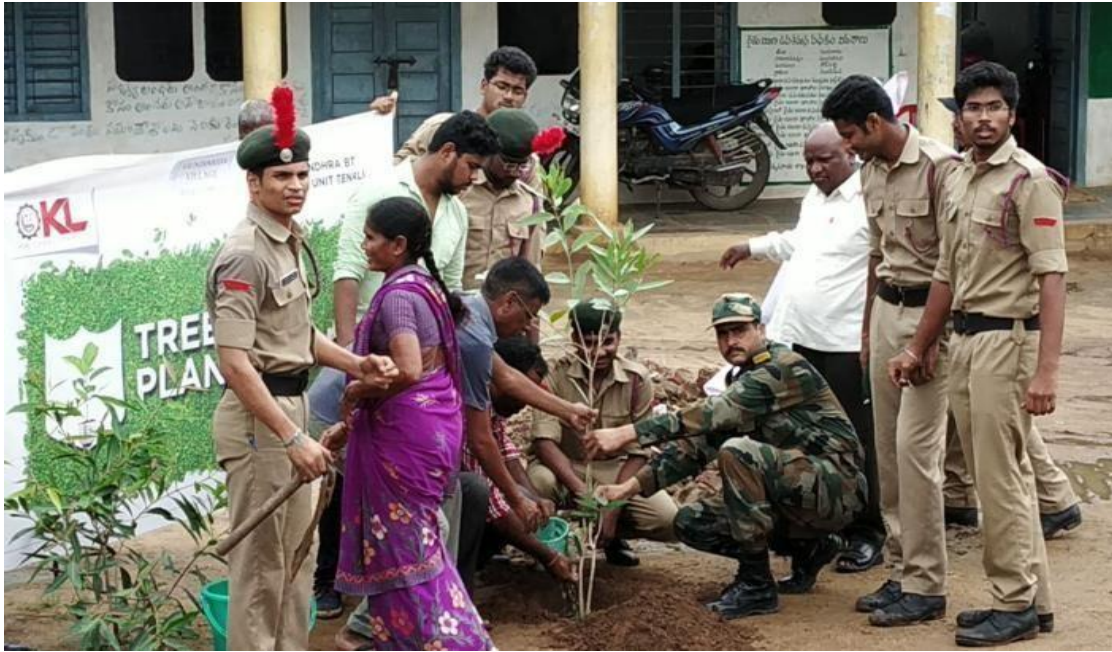
Tree plantation at Gundimeda panchayath office by the Army person from the NCC Battalion.