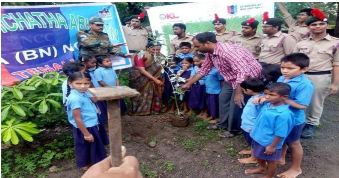
School students participating in the Tree plantation Event with our NCC cadets.