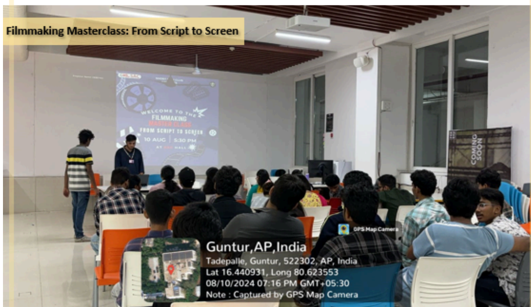
Filmmaking Masterclass: From Script to Screen