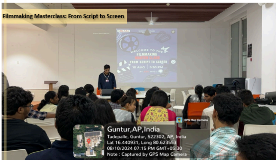
Filmmaking Masterclass: From Script to Screen