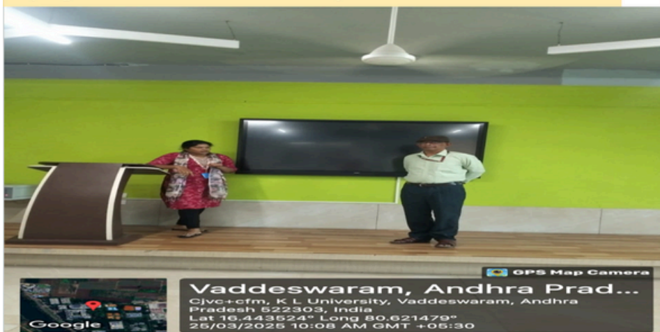
Spotlight On: Festival Theatre Performances by the Drama Club