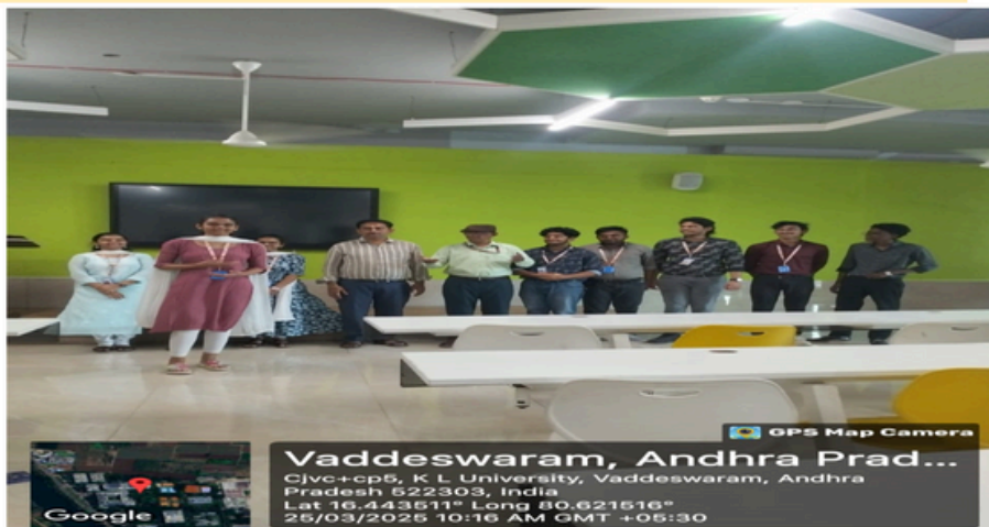
Spotlight On: Festival Theatre Performances by the Drama Club