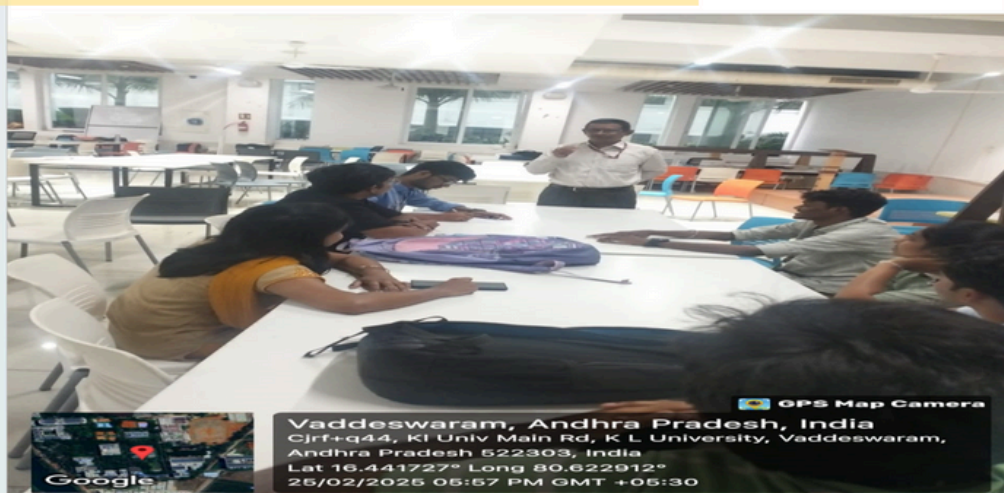
Spontaneity Unleashed: Improv Sessions with the Drama Club