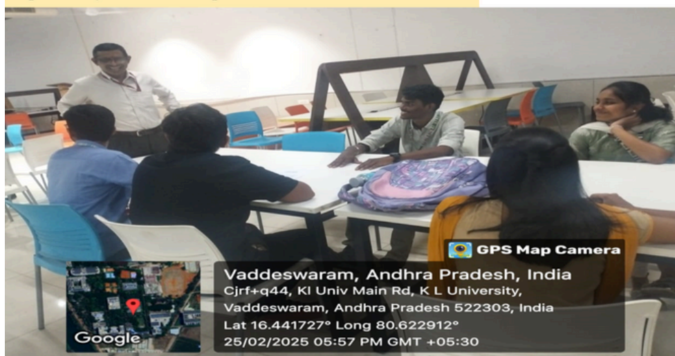
Spontaneity Unleashed: Improv Sessions with the Drama Club

Interaction of student with Mentor during the event