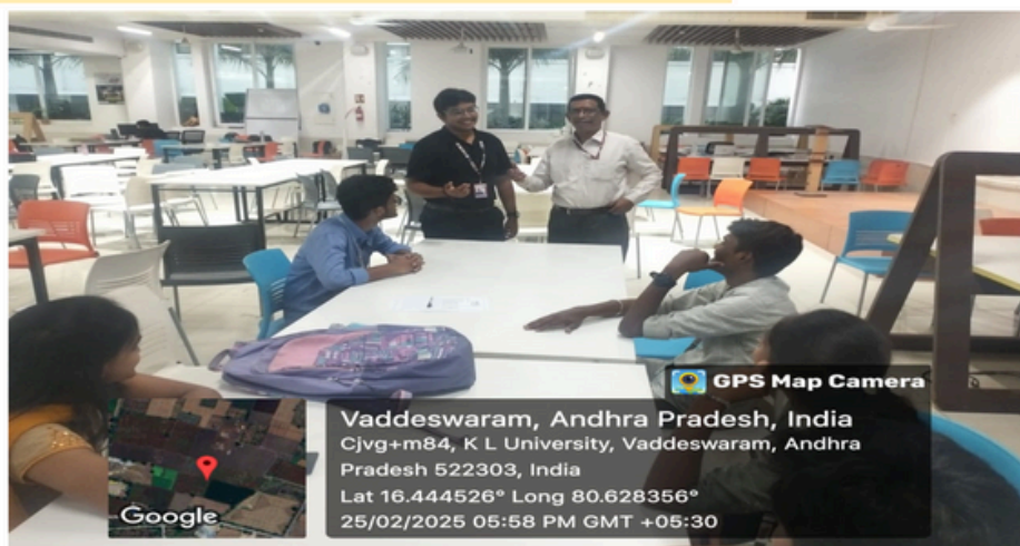
Spontaneity Unleashed: Improv Sessions with the Drama Club