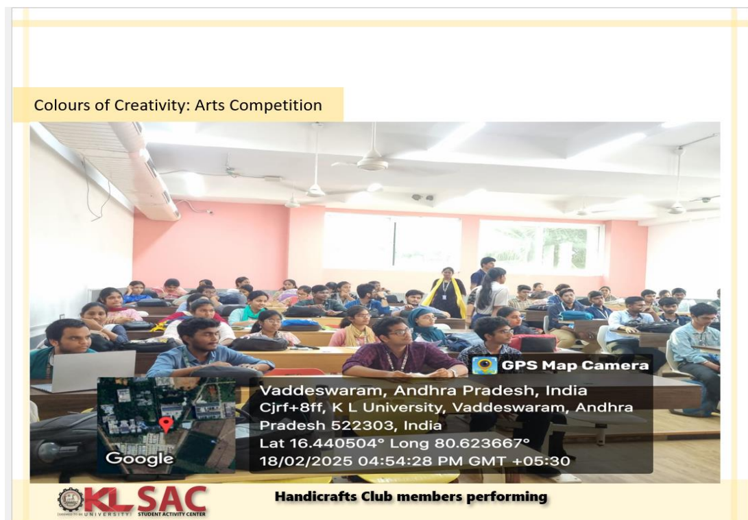
Students actively participating in the event