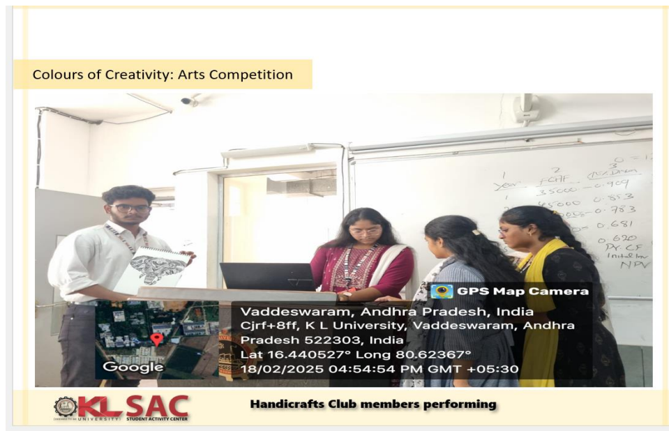
Students showcasing their art works at the event