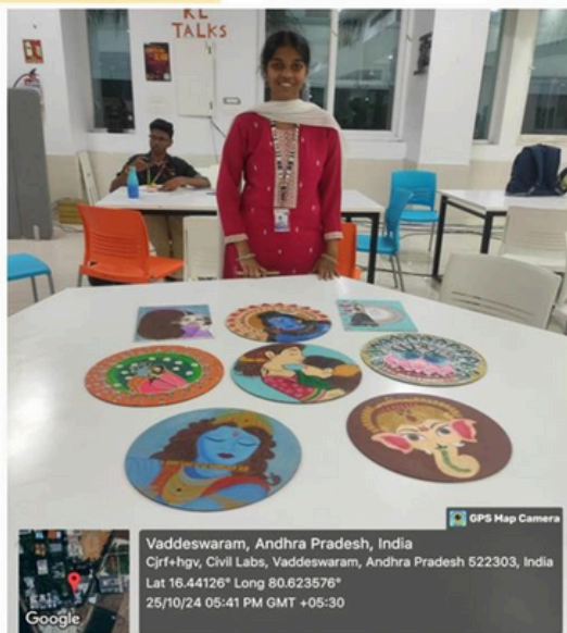
Creative canvas: Student art exhibition