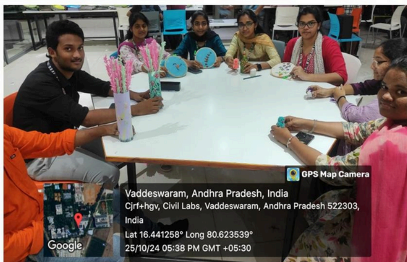
Creative canvas: Student art exhibition