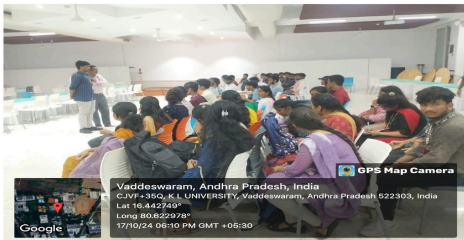
Solo Act Showcase: Expressive Monologue Competition