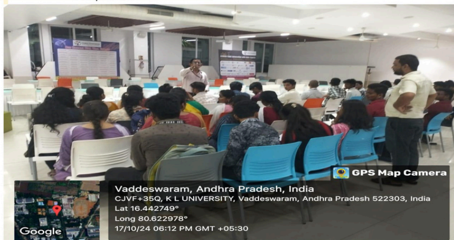
Solo Act Showcase: Expressive Monologue Competition