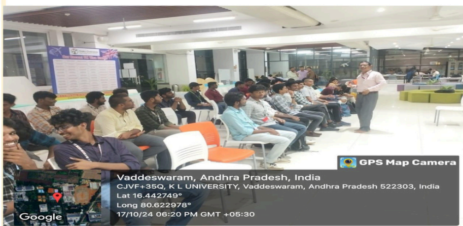
Solo Act Showcase: Expressive Monologue Competition