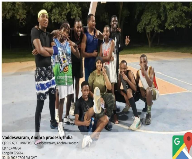
Vaddeswaram, Andhra pradesh, India CJRF+932, KL UNIVERSITY, Vaddeswaram, Andhra Pradesh Lat 16.440764 Long 80.622684 30-10-2022 07:06 PM GMT