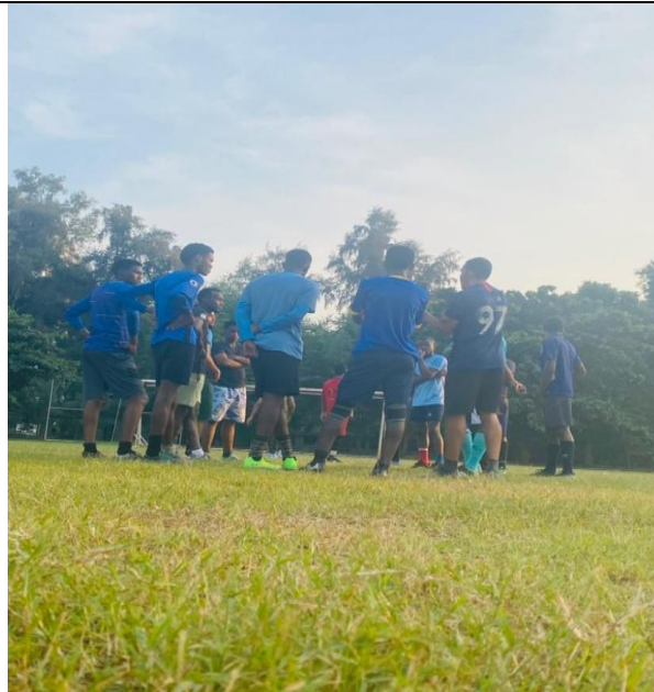
African Studetns participating in Spots events on the eve of AFROFEST -2022