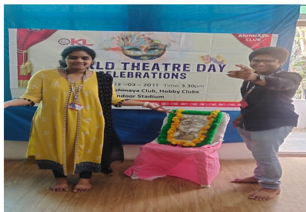
Students of KLEF actively and enthusiastically participated in the Acting Training