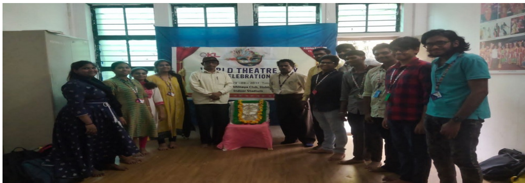
Group photos of abhinaya club who organised World theatre day at KLEF