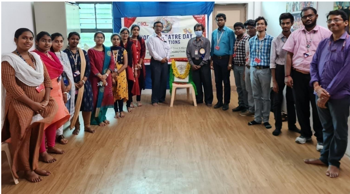
Students actively and enthusiastically participated in the celebrations of World Theatre Day conducted by Abhinaya club, Hobby clubs, KLEF.