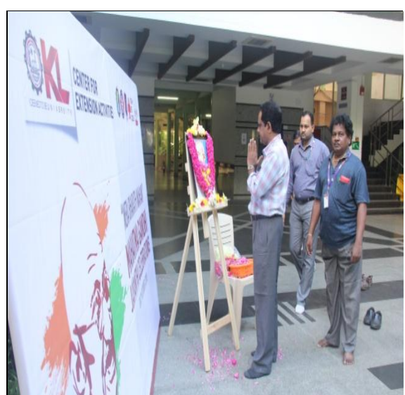
Garlanding to Mahatma Gandhi – By faculty, staff & Students