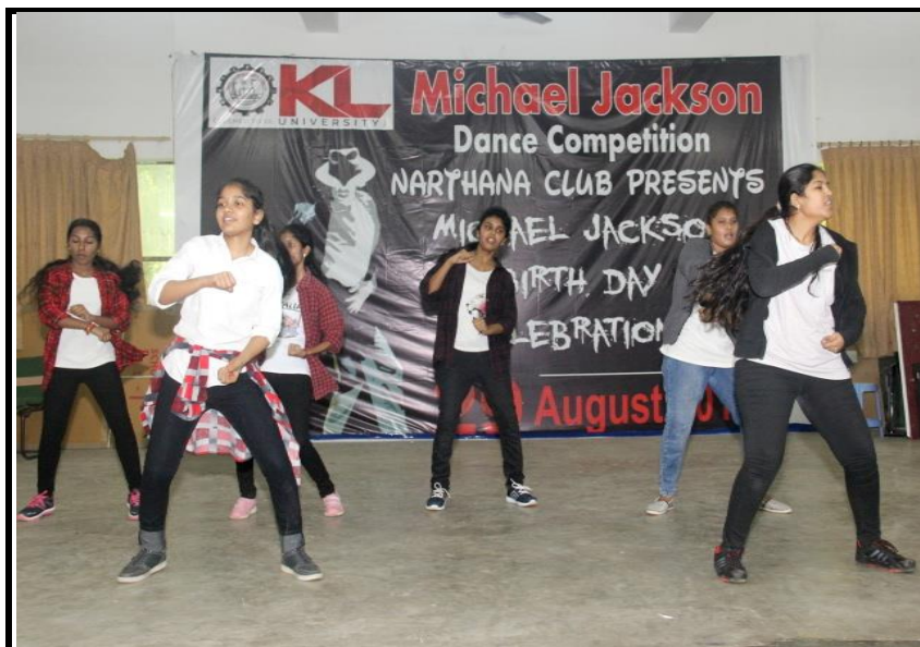
Dance performance by Club Students

The Michael Jackson Birthday Dance Competition featured electrifying performances inspired by the King of Pop's iconic moves and music. Dancers showcased their talent and paid tribute to Michael Jackson's enduring legacy.