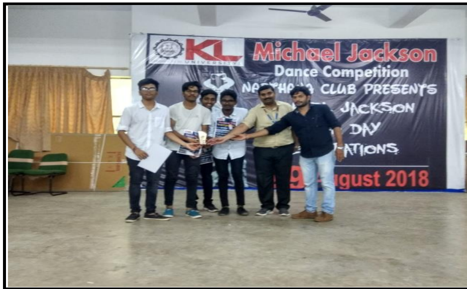
Prizes distribution for Participated Students