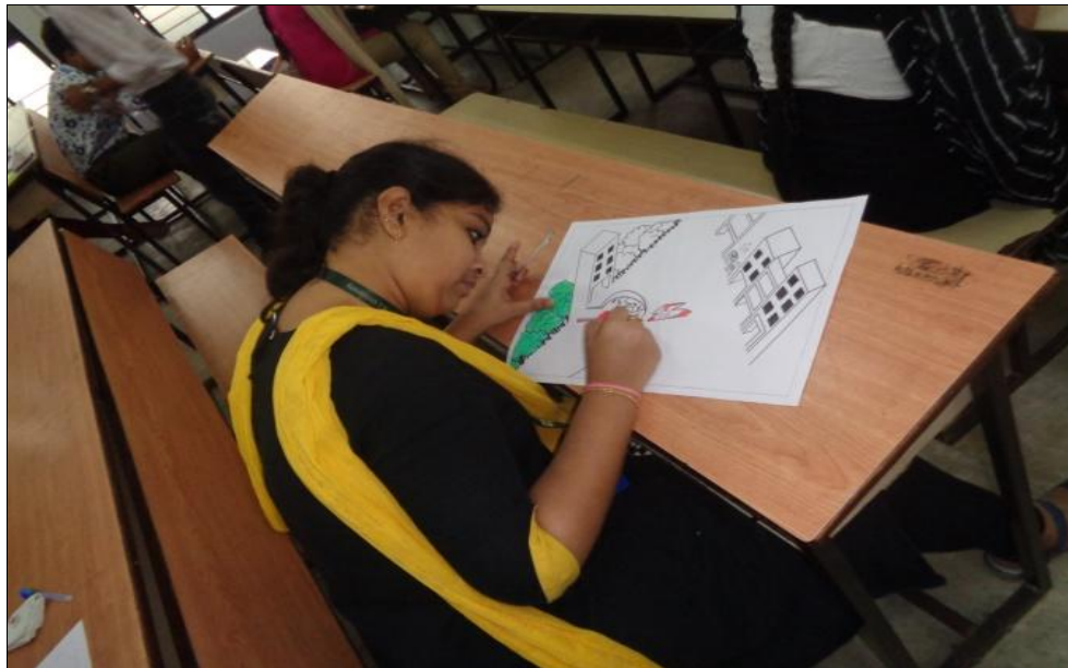
Participation of KLEF Student in Drawing Competition