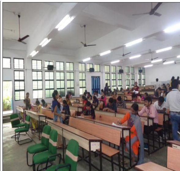
Participation in Elocution, Essay Writing – of KLEF Student