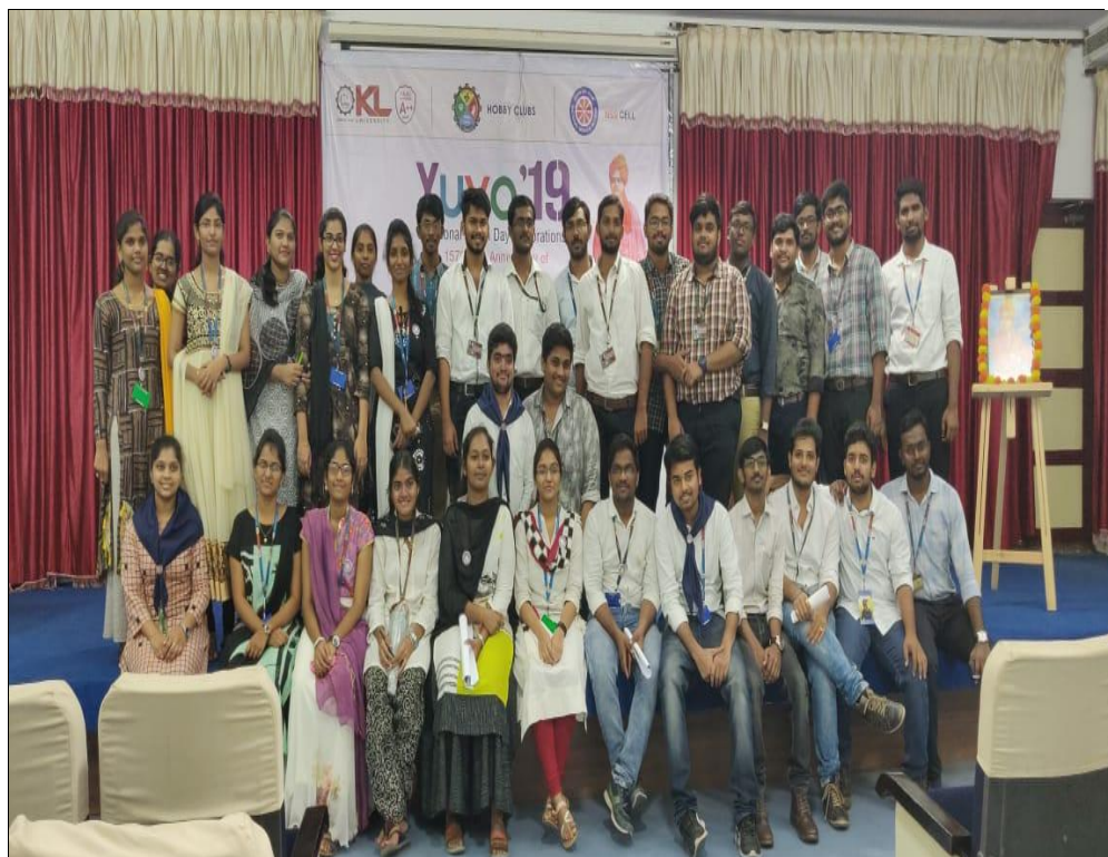
Participated Student gathering.