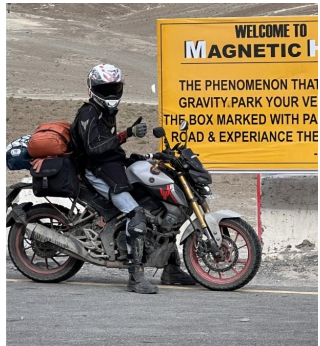
Record Breaking Ride-Business Analytics Student Conquer the Himalayas