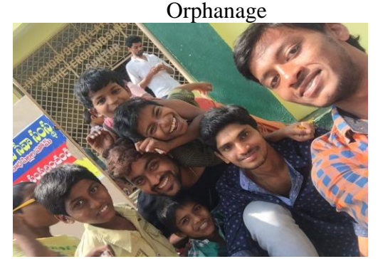
Playing with orphans