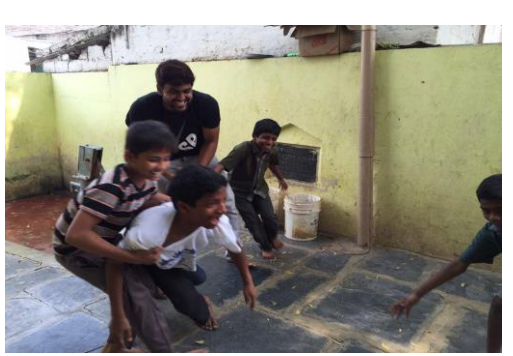
playing with orphans