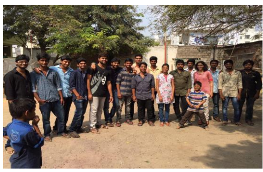
NEMISIS team in the orphanage