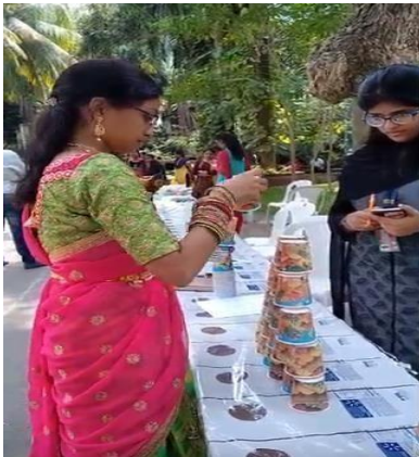
Telugamayi & Colours Competition

Spot events are arranged for women faculty, staff and students.