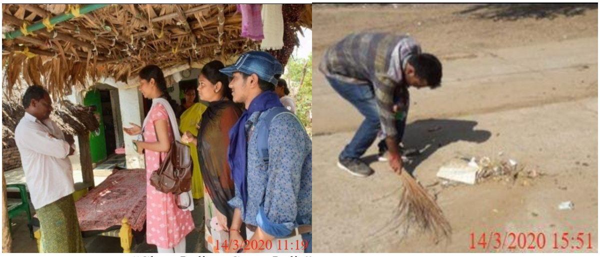
"Clean India – Green India"

Afternoon of the second day About 20 volunteers divided into sub groups and went in to the streets, lanes and by lanes of the village. Few groups organized a cleanliness drive Swatch Bharat by selecting a street nearby the panchayat office. Volunteers cleaned the village roads, removed dust heaps.