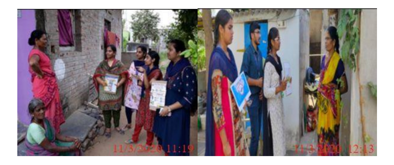
"Cleanliness Is Next To Godliness"

Volunteers attempted to create awareness on cleanliness and hygiene volunteers participated actively and encouraged villagers to keep their streets neatly so that there will be less mosquitoes and good surroundings as a result the villagers are not affected with infectious diseases. This programme aimed to aware the people on cleanliness, Health and Hygiene in the village. NSS volunteers appreciated the people who use pits and maintain cleanliness in their homes and streets.