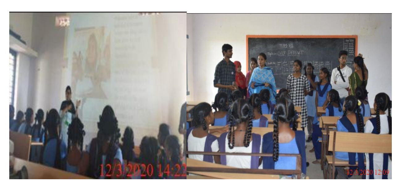
"Educate a Girl and She Will Change the World"