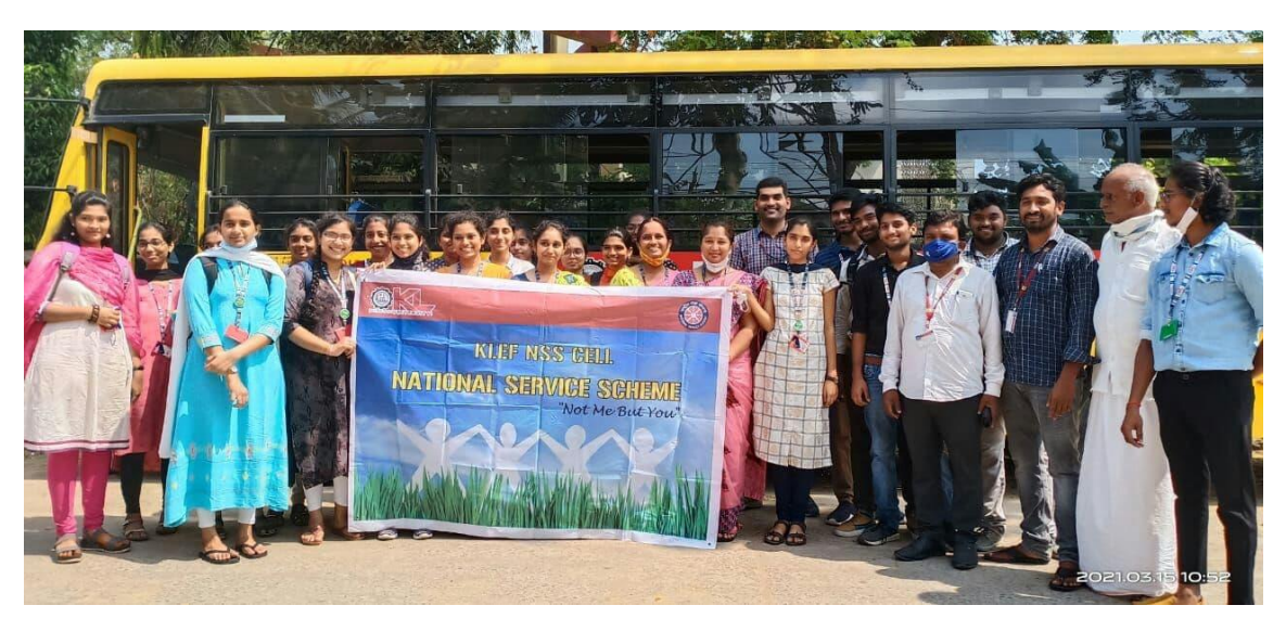
"Water Water Every Where, Try To Save It If You Care" "Don't Let Water Run In the Sink Our Life Is On the Brink"