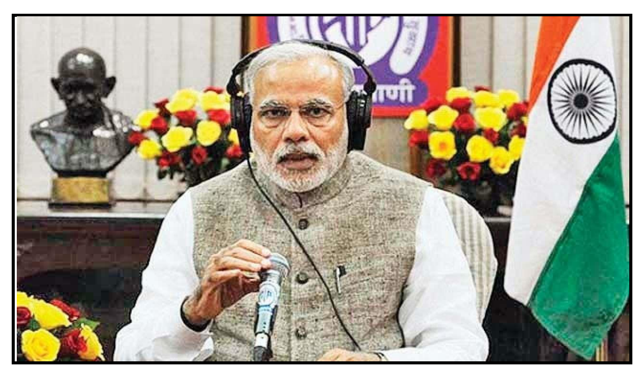
Its 68th Edition of 'Mann Ki Baat'