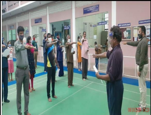
"Stay Home Stay Safe" "Follow All the Precautions to Reduce the Spread of Virus"