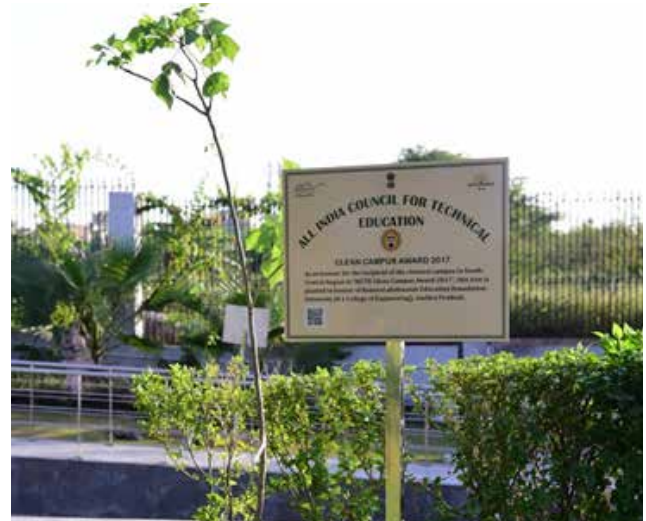
Tree planted in AICTE Campus honouring K L University

AICTE had given merit points for keeping the campus clean all the time. AICTE honored K L University for this achievement with a tree ( Tree Id: Clean_Campus_008 ) planted in AICTE Campus on 2nd October 2017 whose care shall be taken by AICTE.