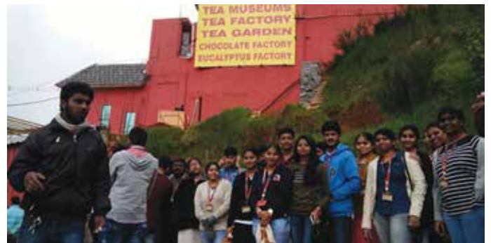
Industrial visit @ Tea Factory in Ooty