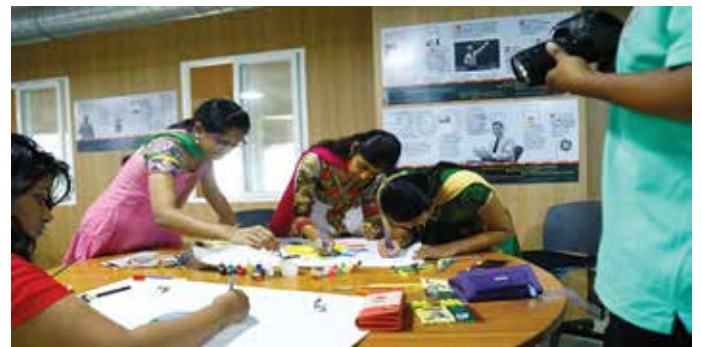
Collage competitions conducted on account of International Youth Day