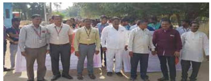
A procession of anti AIDS on 1st December 2017 in Vaddeswaram Village.

BBA Students of K L Business creating awareness on Govt. Programs at Ippatam Village