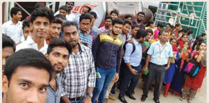
MBA 1st year students participated in Industrial Visit at Coca Cola Plant, At Atmakur, Guntur on 11th August 2017