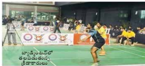
బ్యాడ్మింటన్ లో తలపెట్టుతున్న క్రీడాకారులు

తాడేపల్లి: కేఎల్ డిమ్స్ విశ్వవిద్యాలయంలో జరుగుతున్న సోల్ టోకే అంతర్ విశ్వవిద్యాలయ బ్యాడ్మింటన్ పోటీలు శుభ్రంగానే మూడవ రోజుకు చేరుతున్నాయి. ఆస్ట్రేలియా క్రీడాకారులు పోల్యాథోడిగా అనుభవజ్ఞుడై ప్రధాన పోటీ ఆడుతున్నారని, కేరళ రాష్ట్రాల మధ్య సాగుతుంది. వ్యక్తిగత, బృంద విభాగం పోటీల్లో హుడా ఈ మూడు రోజుల క్రీడాకారులను కల్పింట్, కెలంగాణ, పాండేచేరి క్రీడాకారులపై అవసరమైన ప్రదర్శిస్తున్నారన్నారు. నాలుగువ రోజున కనివారం మధ్యాహ్నం నుంచి క్వార్టర్, సెమీఫైనల్స్ మూడవ జరుగుతాయని కేఎల్ యూ క్రీడా విభాగం