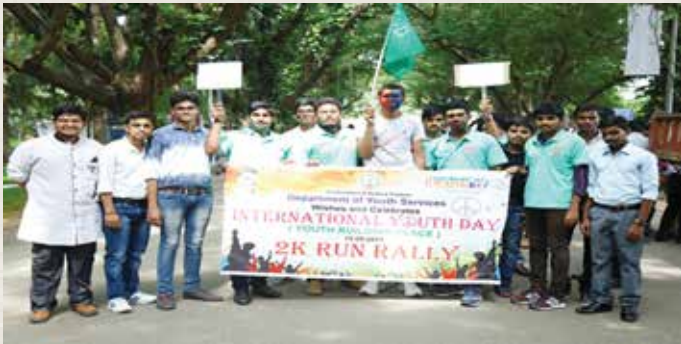
2k Run held on 12th August 2017 on the occasion of International Youth Day