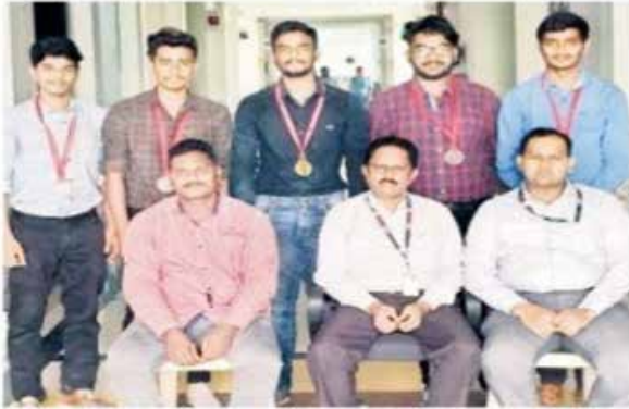
జాతీయ రోలర్ హాకీకి ఎంపికైన కేఎల్ యూ విద్యార్థులు