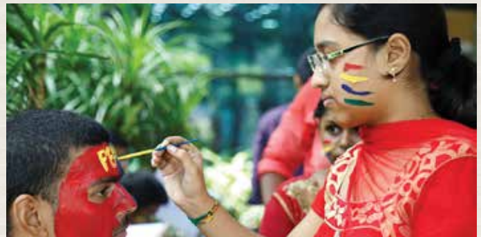
Face Painting competitions held on the eve of International youth Day