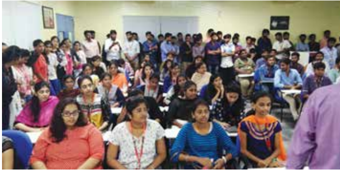
Industrial visit @ Micro Labs in Bangaluru

As a part of Industrial visit, III BBA, IV BBA and II MBA students visited many industries such as Bangalore Micro Labs, Ooty Quality's coffee, Bench Mark Tea and Chocolate company in November 2017