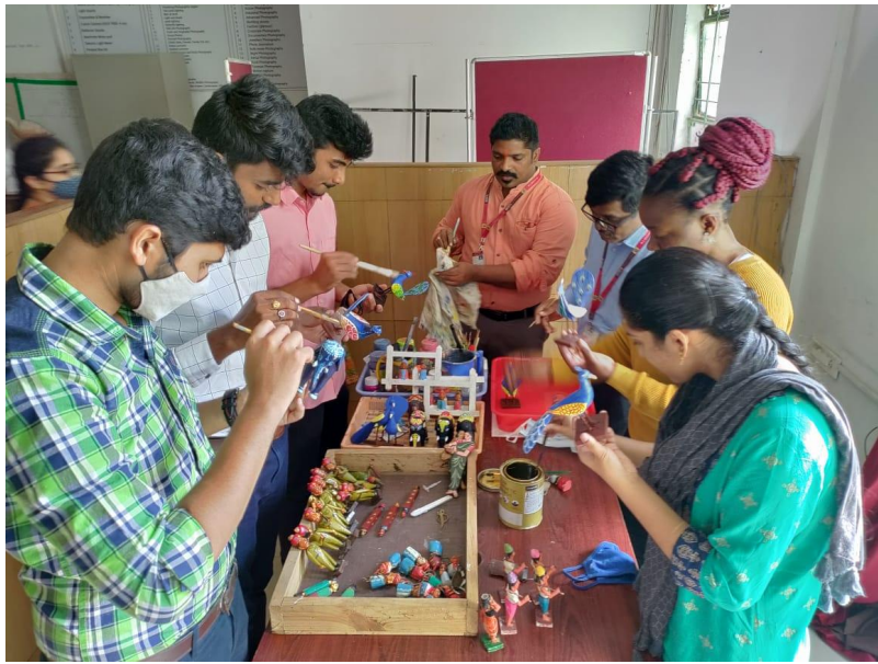
Faculty in charge