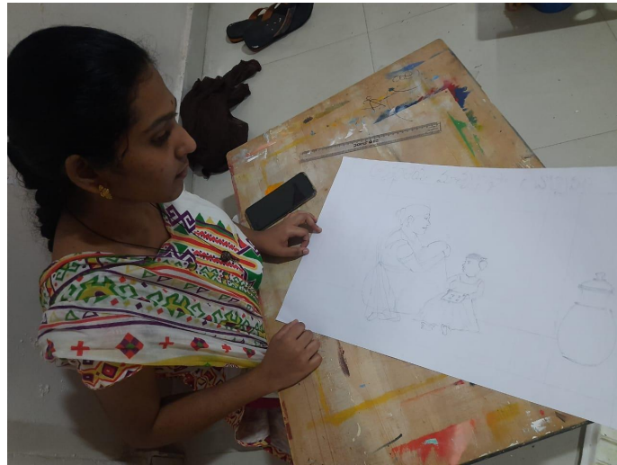
Faculty in charge