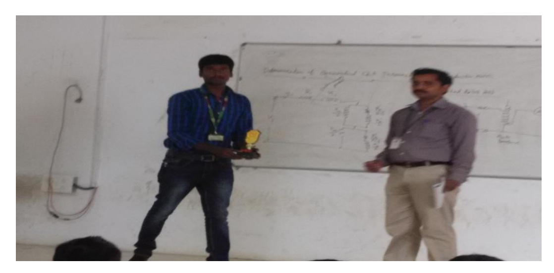
Prize distribution to winner