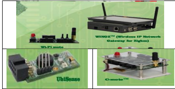
Wireless Sensor Network Development Kit