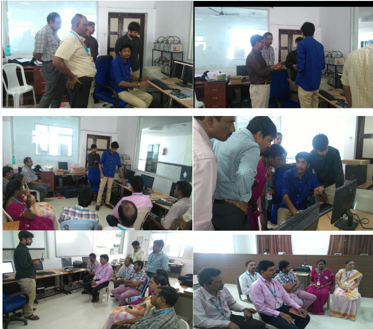
Faculty Participation in the workshop

Practical applications /experiments using the kits were also demonstrated.