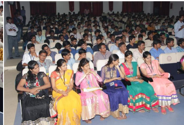
Students participation in the workshop