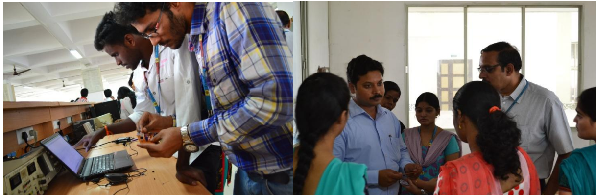
DRILLING AND PLACING THE COMPONENTS ON PCB BY STUDENTS