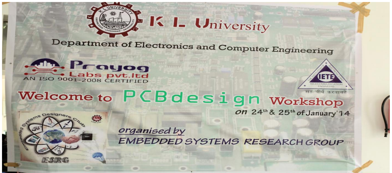
WORKSHOP ON PCB DESIGN