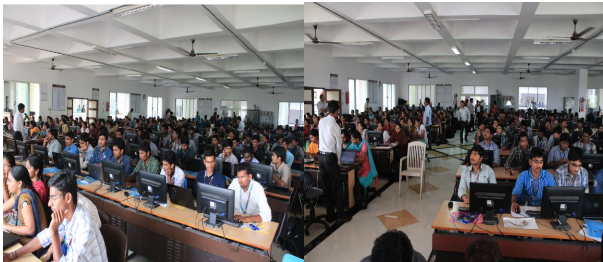
STUDENTS LEARNING AND DESIGNING PCB LAYOUT USING KICAD TOOL