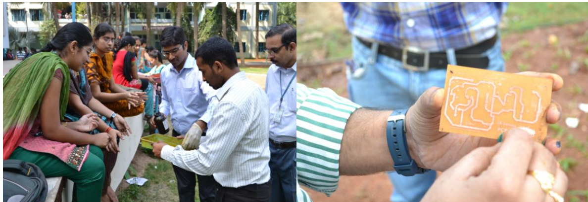
ETCHING OF PCB BY STUDENTS