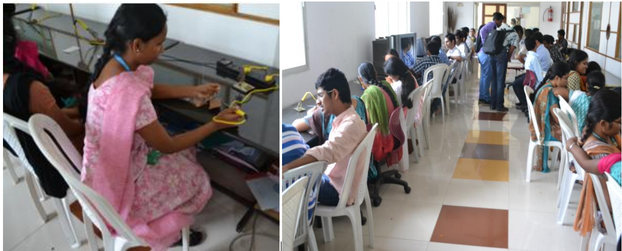
SOLDERING THE COMPONENTS ON PCB BY THE STUDENTS