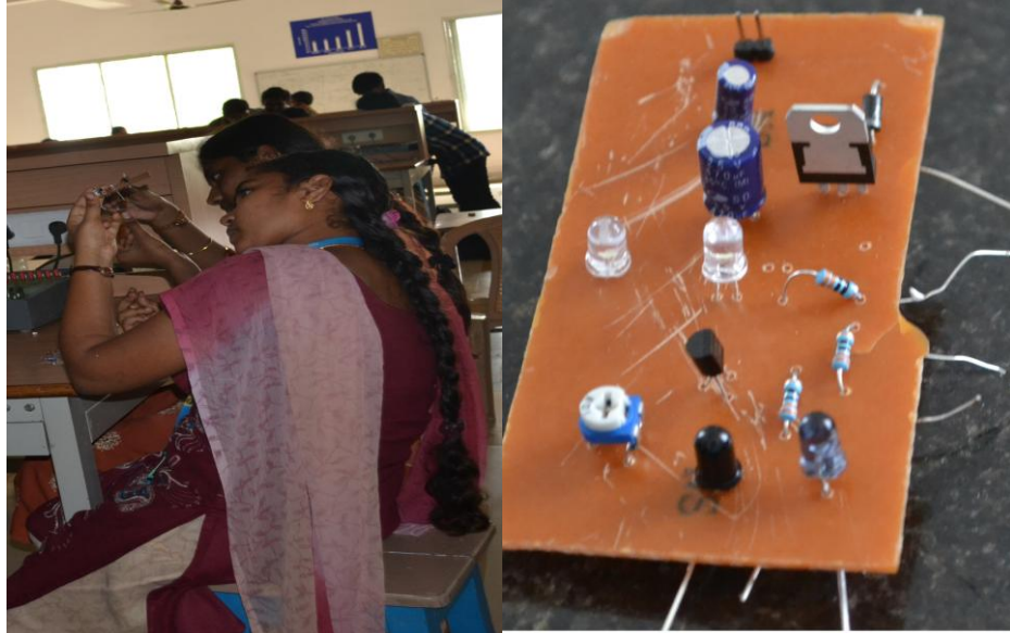
TESTING THE PCB BY THE STUDENTS