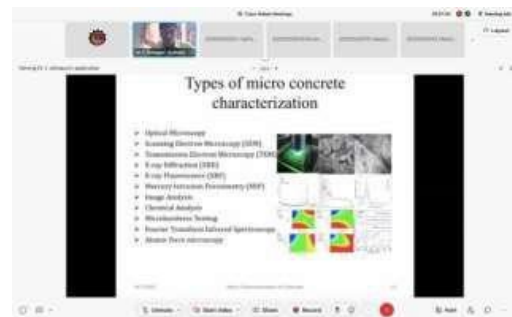
Fig 4: Speaker 3 - Introduction on session and types of micro concrete characterization.

Last but not least, I would like to give vote of thanks. I thank each and every one for joining us today by making this workshop success.