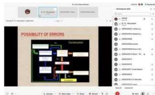
Fig 3: Speaker 2 - Introduction on session and Possibility of Error

Thank you, sir, for such a wonderful presentation. Our audience explored the practical mistakes on the construction sites once again thank you sir for enlightening us. Now, we will have the short break for lunch and again we will join by Sharp 2PM.