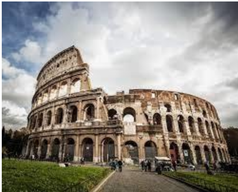
-Colosseum of Rome-