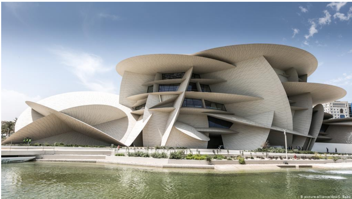
-National Museum of Qatar-

Along with that, an overview of the design, construction, and uniqueness of the famous civil engineering structures of the world, National Museum of Qatar, Hoover Dam and Colosseum of Rome is given by a student from our Department.