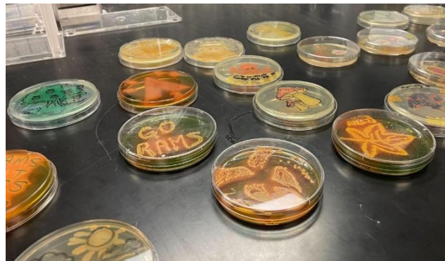
Sample certificate and Petri art conducted in microbiology lab, C310

International Microbiology Day serves as a reminder of the critical role that microorganisms play in shaping our world. Through education, outreach, and research, we can continue to harness the power of microorganisms for the benefit of society.