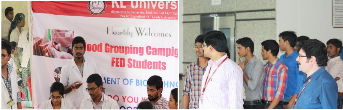
Faculty and students at blood typing near FED block, KL University

The event witnessed enthusiastic participation from a large number of students of about 370, faculty, and staff. Engaging activities and informative sessions ensured a well-rounded learning experience for all attendees. Flyers, posters, and social media posts were used to advertise the campaign dates, location, and benefits of knowing your blood type. A registration desk was set up to collect participant information and ensure a smooth flow.