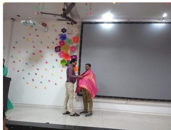
Celebrations of Teachers Day of Biotechnology students