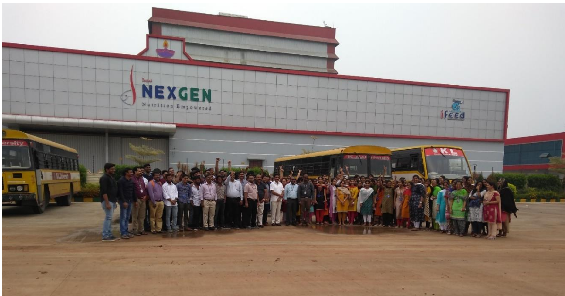
Faculty and Students at Deepak Next Gen Aqua industry

The management has offered lunch to all of us followed by a presenting their future goals by 2020. The founder of the company and CEO addressed all of us and explained their company to the micro level. The students have learnt so many things on that day especially the importance of hard work, how the company has emerged to be one of the top most companies from a small pilot lab.