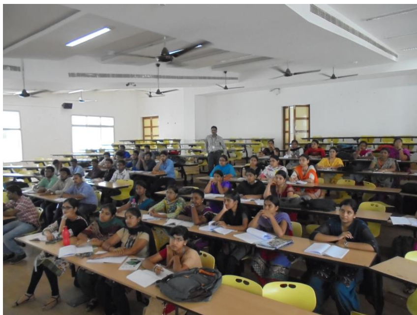
Students following the webinar with complete attention